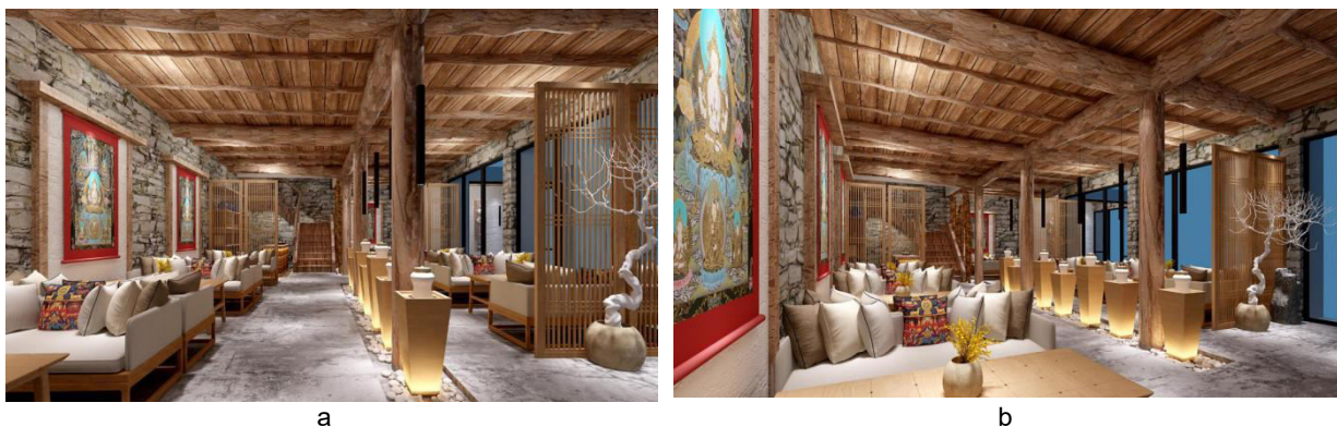
Figure 2. Pioneer design bar "hotel tea house series" (2021-1-27)

the space. This approach not only increases the aesthetic value of the interior but also turns each space into a cultural artifact that preserves and showcases the essence of the nation. For interior designers to produce high-quality designs, they must innovate continuously, paying close attention to contemporary artistic trends while deeply understanding diverse traditional cultures. By excavating and applying valuable design elements, designers can elevate the level of interior design [5].